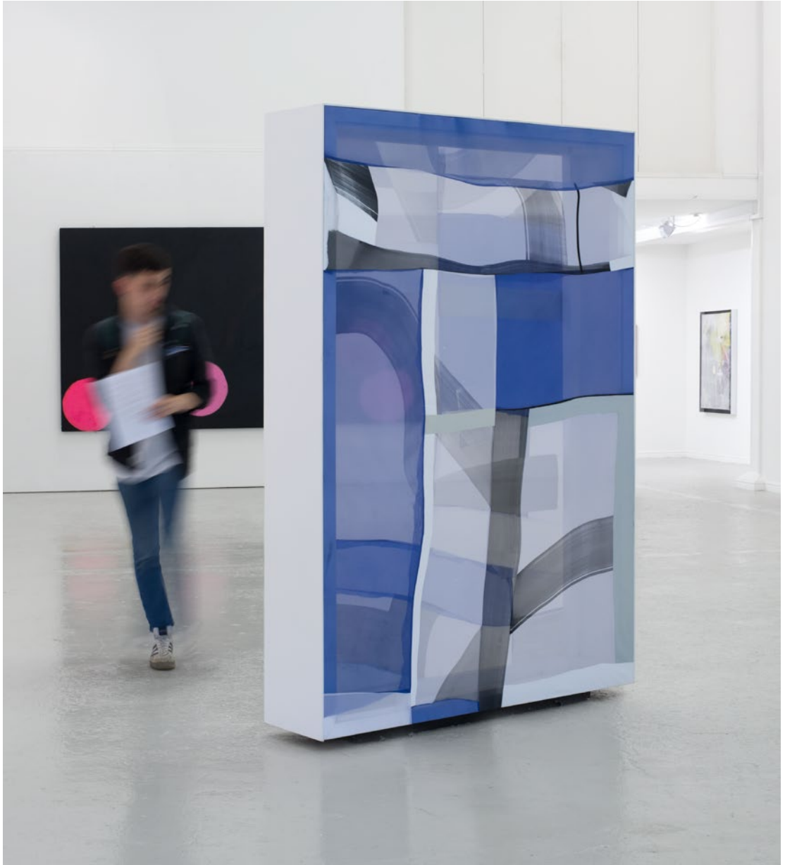
Antoine Langenieux-Villard, 'Veduta' (2017), acrylic, ink on dyed and sewn materials, 140 x 200 x 34 cm