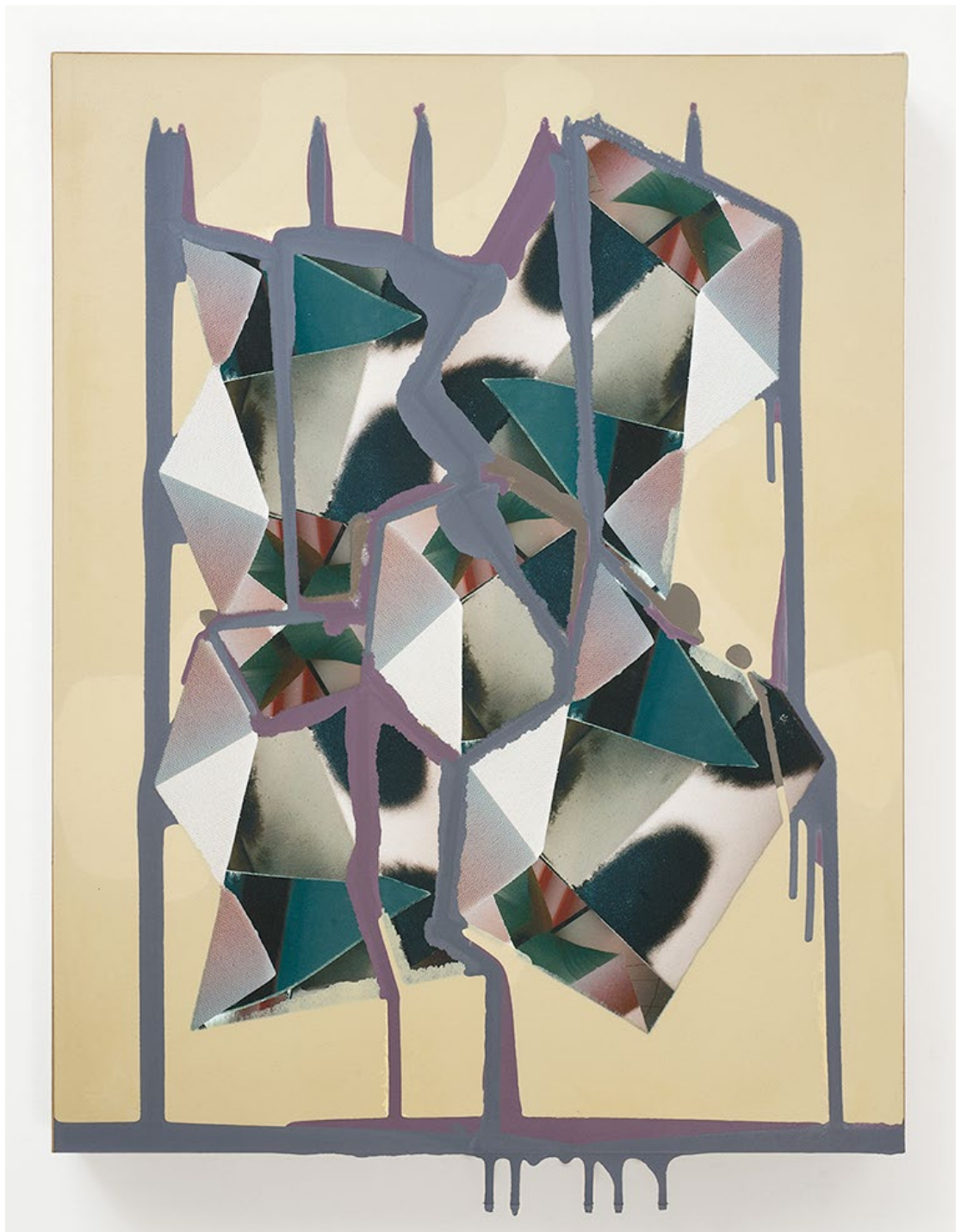
Jim Cheadle, 'Fragmentation No.36' (2016), resin, pigments, inkjet prints, MDF, 70 x 54.5 x 6.5cm

Indeed, echoes of Support/Surface can be heard throughout the show. Jim Cheadle and Antoine Langenieux-Villard both foreground how the structure of the support can create its own visual language as it simultaneously underpins and undermines the picture surface. Cheadle brings the folded planes of a cubist vocabulary to bear on painterly bleeds of colour. This pushing of hard edges against soft gradients generates illusions of shallow space, creating a peculiar rhythmic visual charge. In a free-standing work angled across the centre of the gallery, Langenieux-Villard creates calmer rhythmic turns, rendered in repeated gestures of cooler tones. The gentle, meandering gestural marks move in shifting blue tones across some sort of transparent surface, anchored in a deep box frame: the subtle tonal transitions encourage careful looking as one moves around the boxed images. As one peers through its translucent surfaces, moments from the quiet street outside the gallery are captured and held within it: framed by the cabinet-like form, they float in and out of focus.