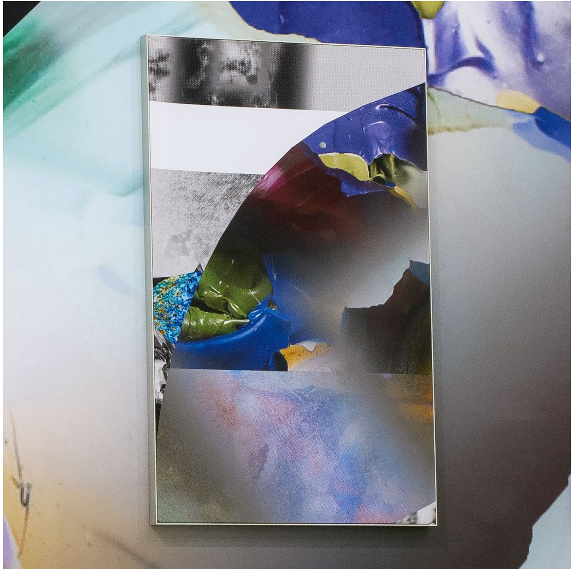
Peter Lamb, 'The same in Animal form' (2017) Detail, digital print on synthetic canvas, aluminium subframe, 280 x 190cm