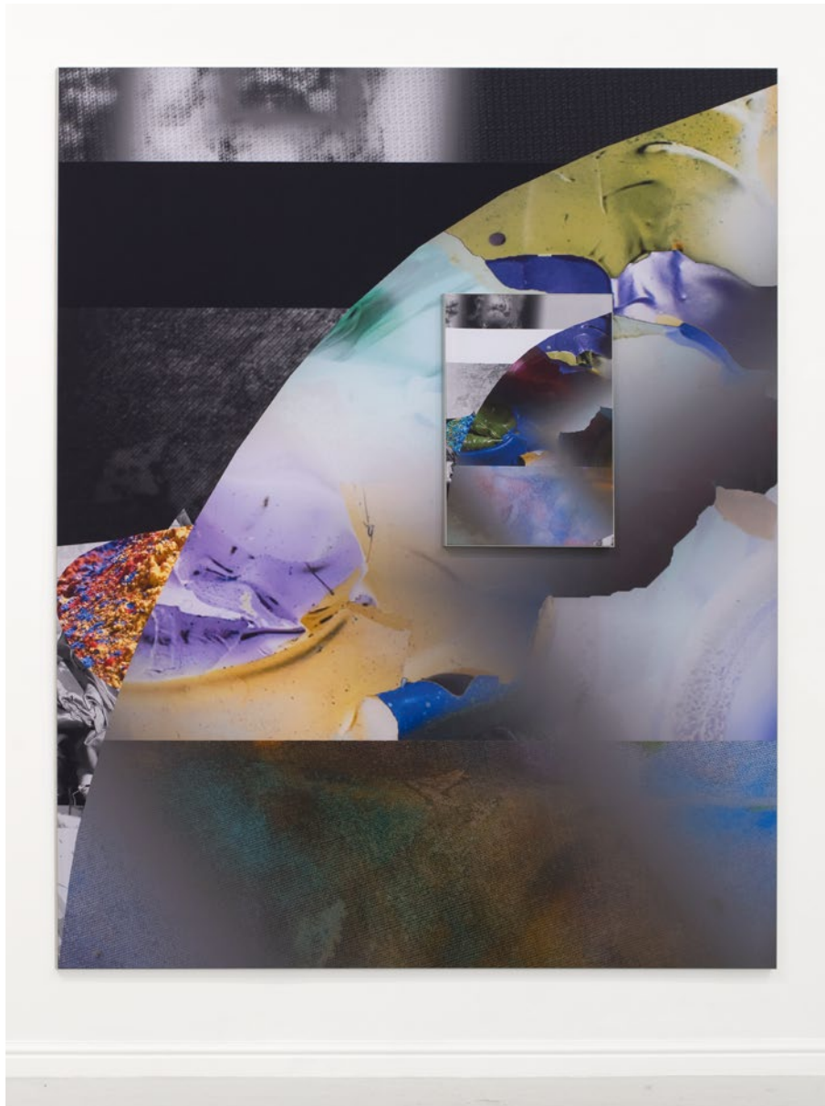
Peter Lamb, 'The same in Animal form' (2017), digital print on synthetic canvas, aluminium subframe, 280 x 190cm

He seems to digitally twist and turn this dense painterly matter over and over, adding layer upon layer of imagery as he goes; and one is also reminded of the giant mega-tarpaulins, that new generation of hoardings that can cover the entire sides of multi-storey buildings in advertising imagery. In all of this, there is a strong sense of visual hide-and-seek: the obsessional layering of films of paint of many a late modernist painter finds its equivalent in Lamb's endless overlaying of representations of painterly imagery, which seem to bleed back into one another, or suddenly split apart, only to reconfigure via the operations of the computer screen. And yet, despite all these digital manoeuvres, the level of complexity in colour-play and the just-so melding of contrasting formal arrangements, born of inherently visual decision-making, makes this painting with a capital 'P'. The overall effect is scintillating and fascinating. Each painting has a singular presence and a weight all its own.