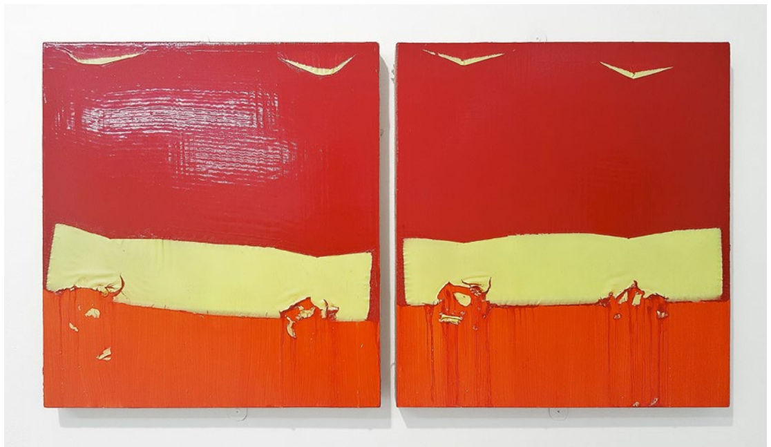
Alexis Harding, 'Landing (twice)' (2018), oil and acrylic on canvas, 50 x 93cm